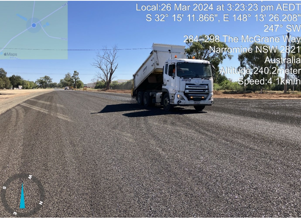
Figure 3: Sealing of McGrane Way / Gainsborough Road Intersection

Council is encouraging staff to use a mobile app called TimePhoto which records time, date and location of the photo. This app is incredibly helpful for grant funding purposes and allows staff to remember where photos have been taken. These photos are being used within the reports to assist with information capture.