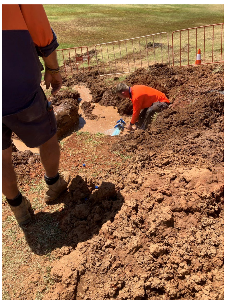
Figure 2: Parks and gardens staff repairing an irrigation main pipe leak

The parks and gardens team is kept busy monitoring and repairing irrigation lines and managing Council's green spaces and playgrounds.