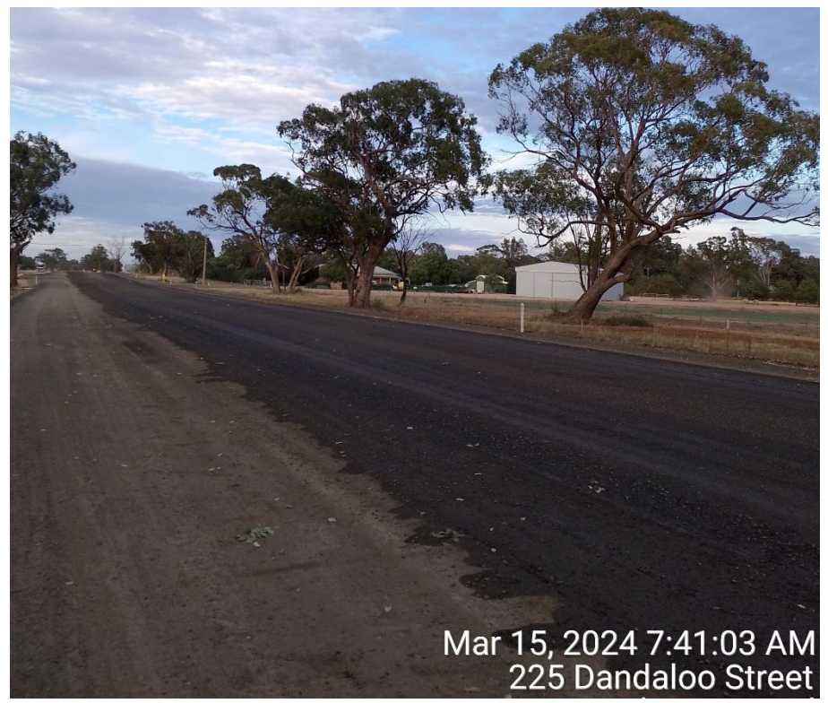
Figure 4: Dandaloo Street has been resealed