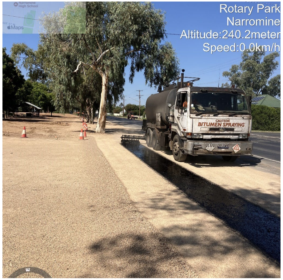
Figure 1: Sealing of the Rotary Park Toilet carpark is underway

Narromine and Trangie Pools have closed for the season but will reopen in late September. Major maintenance over the winter period includes: painting of the Trangie Pool and shade shelter renovations at the Narromine pool.